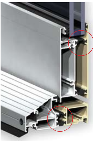
Hinged door frame

When combined with double-glazing, our Designer Series THERMAL HEART™ windows and doors meet contemporary aspirations for energy conservation and comfortable interior temperatures. In terms of thermal efficiency, this new product range rates 32% better than standard double glazed windows and doors.